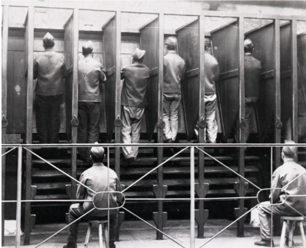
Source 2b : Photograph of prisoner at hard labor in his cell at Wormwood Scrubs Prison. (COPY 1/420 f.171)